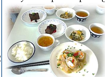
【This is the Medicinal Cuisine】