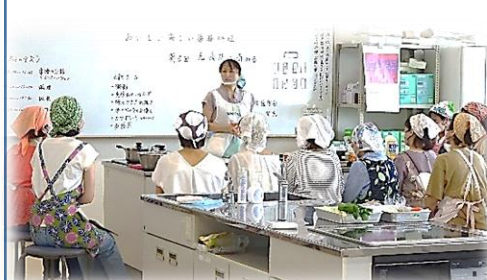
【Students are Listening Attentively】

While explaining the points to boost immunity while looking at the text, she will teach in detail what kind of food to take.